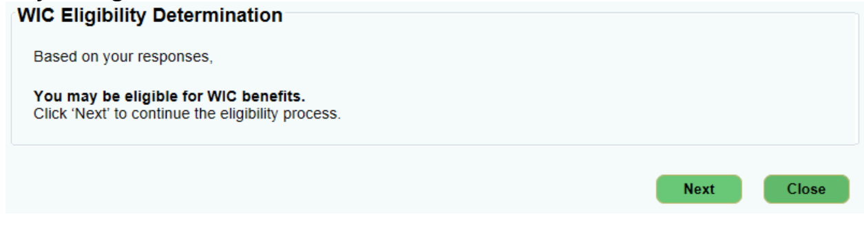
Figure 3 – May be Eligible for WIC Benefits

• Click the Next button to go to the WIC Eligibility Income screen.